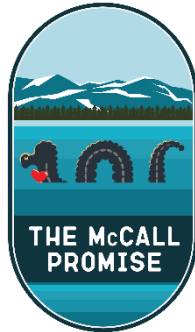
Sign the McCall Promise

Background: The McCall Area Chamber of Commerce and Visitors Bureau is committed to maintaining a desirable quality of life featuring year-round recreational opportunities, as well as a thriving economic climate. The MACCVB works with local businesses, citizen groups, city governments and neighboring communities to see that growth is directed in a positive and beneficial manner. The chamber is the concerted voice of local businesses to promote and protect their interests and the community as a whole.