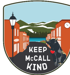
Keep McCall Kind